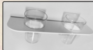
Scoop Wash £34.00