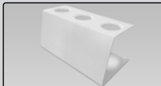
Cone Holder £16.00