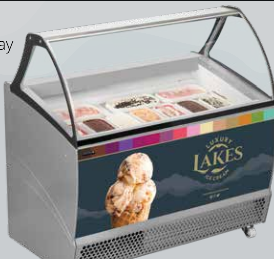
Napoli Pan Layout