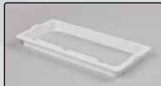
Plastic Tub Collar £3.50