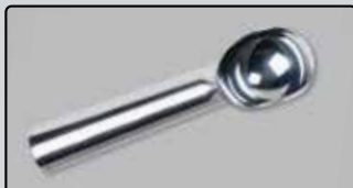
Premium Aluminium Ice Cream Scoop £24.99