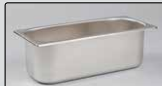
Stainless Steel 5ltr. Napoli Pan £15.00