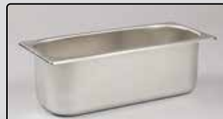
Stainless Steel 5ltr. Napoli Pan £15.00